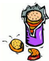
a packet of biscuits