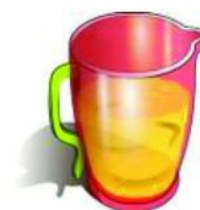
a jug of orange juice