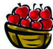
a basket of apples