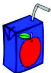
a box of apple juice