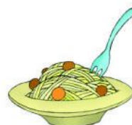
a plate of spaghetti