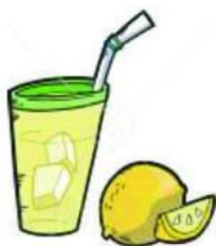
a glass of lemonade