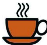
a cup of coffee