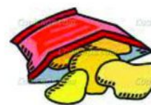
a packet of crisps