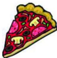
a piece of pizza