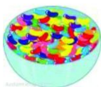
a bowl of sweets